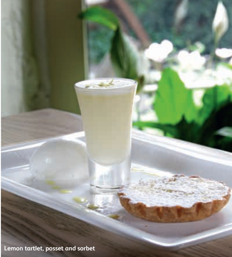
Lemon tartlet, posset and sorbet