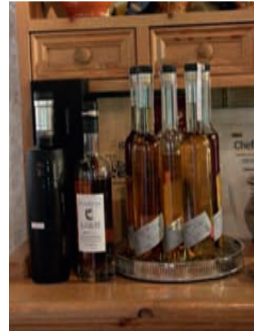
Clockwise from top left:

Roast rack of roe deer; Award-winning Planeta olive oil from Sicily; David Young; The view of the gardens from the restaurant.